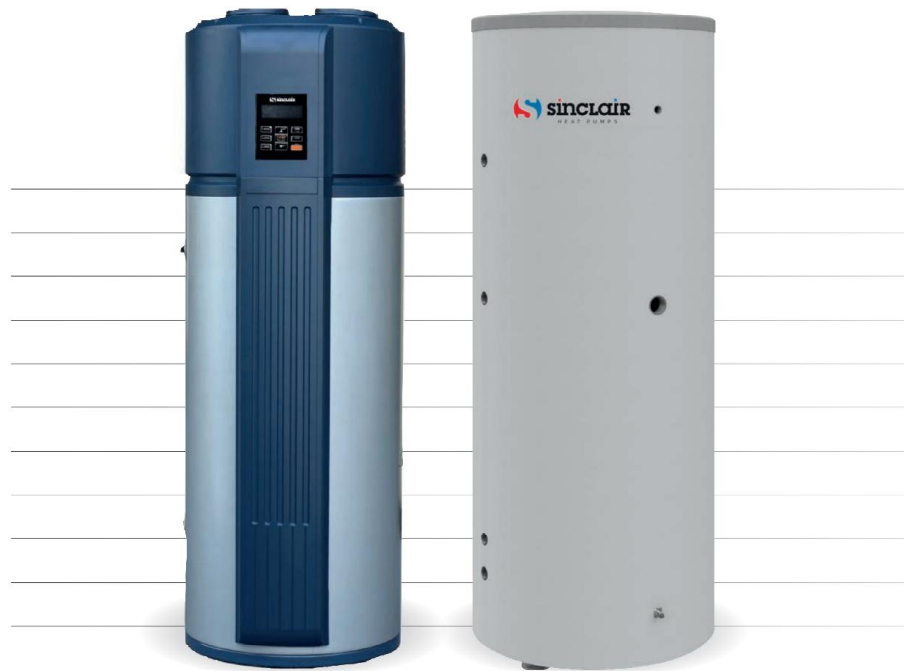
SINCLAIR WATER HEATER SWH-35 / 300TSL