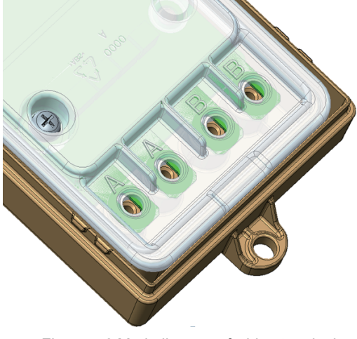
Figure 4-2 Mark diagram of wiring terminal